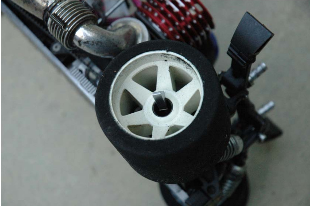
Plenty of rubber remaining on the left rear!