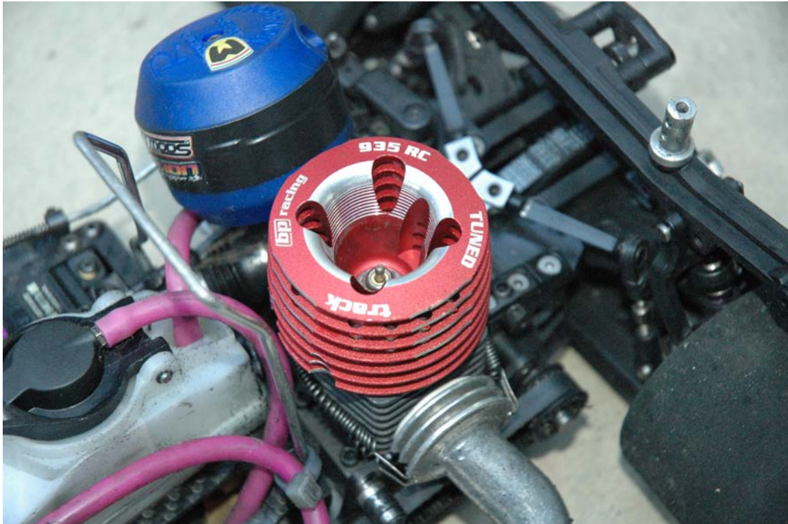
The 935 RC Tuned

Starting in 8th, I had to drive around some wrecks in the opening laps before settling in for the long run to the finish. By the time I did my first pit stop I was battling for the 3rd position and my car was improving as the tires were scrubbing to the right size. I choose a 4 minute pit strategy as I was not sure if my engine would make 5 minutes with the 2052 pipe and long header. This meant I would have to do 1 or 2 pit stops more than normal, but at least my first couple of pit stops would get me in and out of the pits without having to deal with traffic.